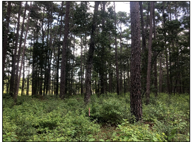
197 acre understory maintenance burn in Montgomery County.