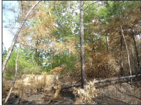
310 acre mixed pine hardwood stand in Polk County.