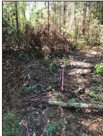
105 acre pine plantation burned following 1 st thinning operation, Nacogdoches County.